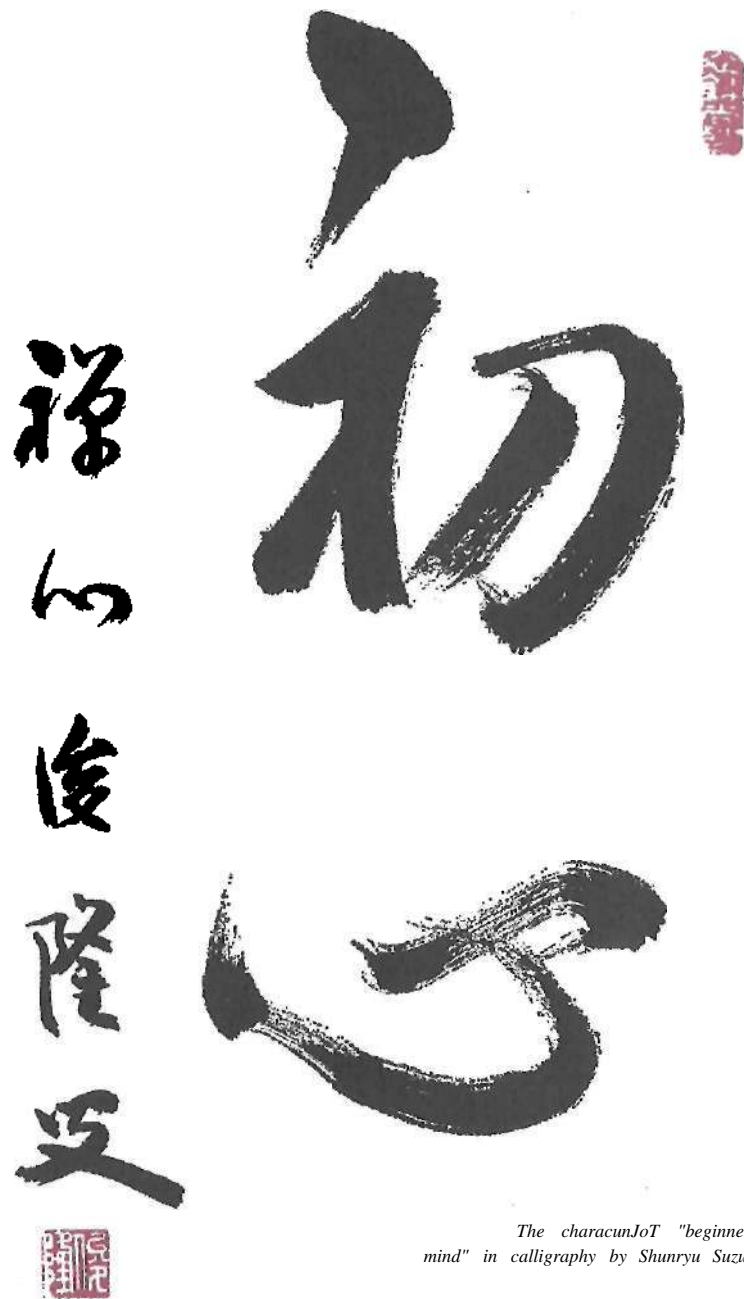
The characters "Zen Mind, Beginner's Mind" in calligraphy by Shunryu Suzuki